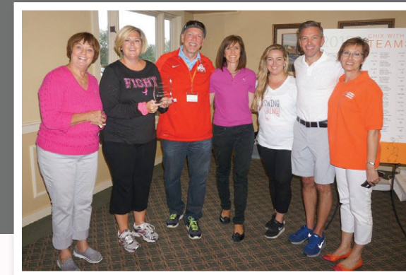
Chix with Stix