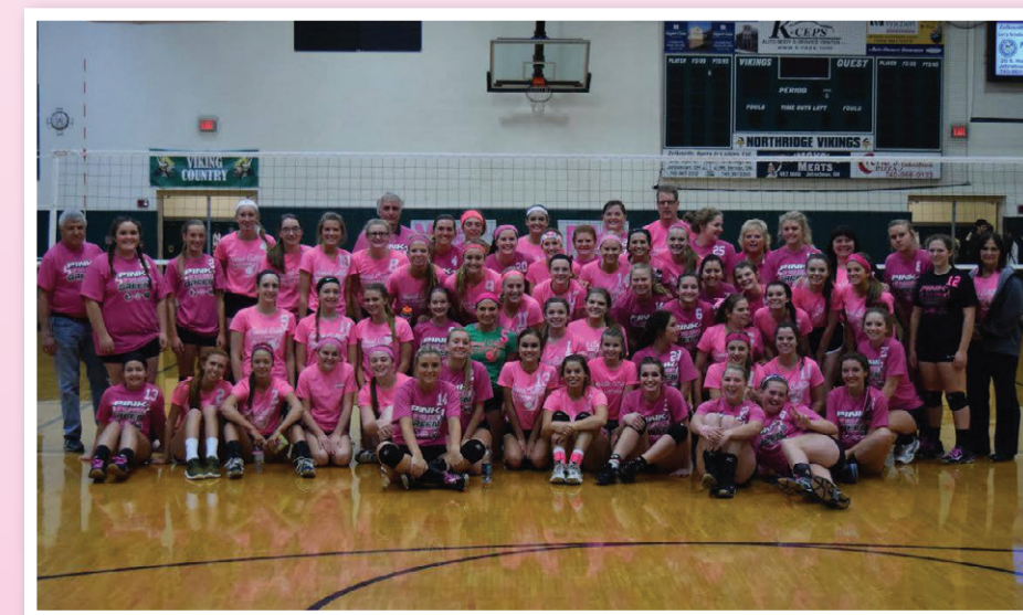
North Ridge Volleyball Pink Out