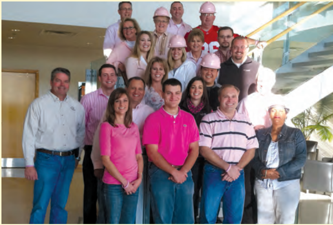
The Westerville office of Kokosing Construction Co., Inc. and Corna/Kokosing Construction Co. organized a day to raise funds for the Stefanie Spielman Fund for Breast Cancer Research. Pictured are the Kokosing Westerville office employees.