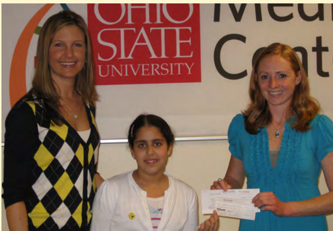
Check presentation for the Maya Mattan Penny War