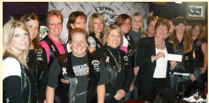
The Columbus Chrome Divas held three events to benefit the Spielman Funds in the last fiscal year, raising over $4,380.