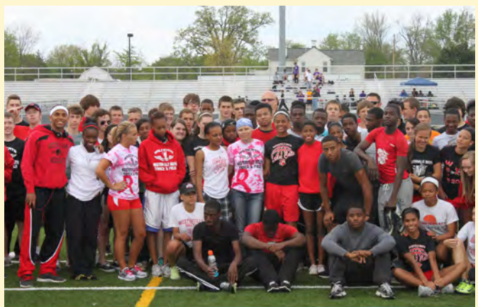
The students at Westerville South High School raised $2,000 for the Spielman Funds at their Westerville South Invitational Track Meet.