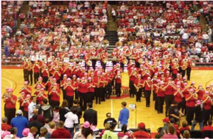
The OSU band forms a pink ribbon during the Women's "Pink Zone" Game.