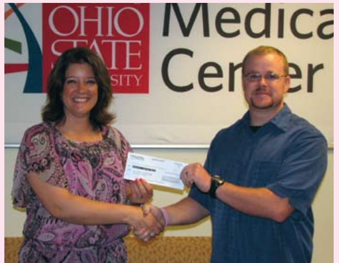
Route 66 Road Rally check presentation.