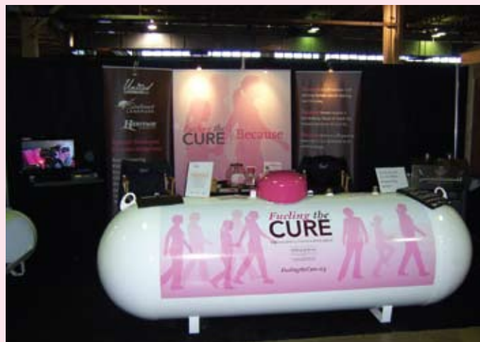
Fueling the Cure at the Home & Garden Show