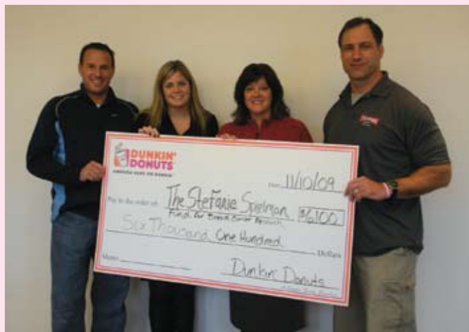
Dunkin Donuts check presentation.